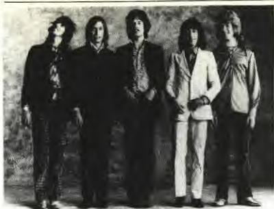
The Rolling Stones

A Stones tour is rarely complete without a black performer, be it Stevie Wonder or Ike and Tina Turner; the black performer gets nationwide fame and fortune; the Stones get a crack at authenticity. Mick Jagger stood in the wings every night to watch Tina and the Ikettes slide, turn, and kick with impeccable abandon; at the time he was content to move about the stage hitting a tambourine until it broke and then hitting another. By the tour's end, much to Tina's surprise, he had managed to devise a unique if labored form of rhythmic dancing, though it is said he repaid their beneficence by having the microphones turned off if they performed too well. B.B. King, Muddy Waters, and most of the long-standing bluespeople were brought to theaters, clubs, and large audiences by bands of their young, white, and much more successful imitators. Brenda Holloway of "Every Little Bit Hurts" sings trifling backups for Joe Cocker; Merry Clayton was "discovered" backing the Stones; Billy Preston was brought forth from the wilderness by George Harrison.