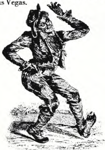
Thomas "Daddy" Rice

E LVIS PRESLEY was the greatest minstrel America ever spawned, and he appeared in bold whiteface. He sang like a nigger, danced like a nigger, walked like a nigger, and talked like a nigger. Chuck Berry, unfortunately, was a nigger. They are two of the more splendid beings in the Great Chain of Minstrelsy that stretches from the start of the nineteenth century to the present, encompassing circuses, medicine shows, Broadway, the Fillmore East, nightclubs, concert halls, television, and Las Vegas.